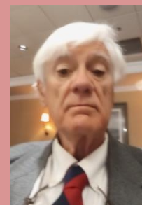
The Tantalus , silently vowing to never take another photo